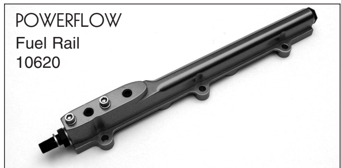
POWERFLOW Fuel Rail 10620