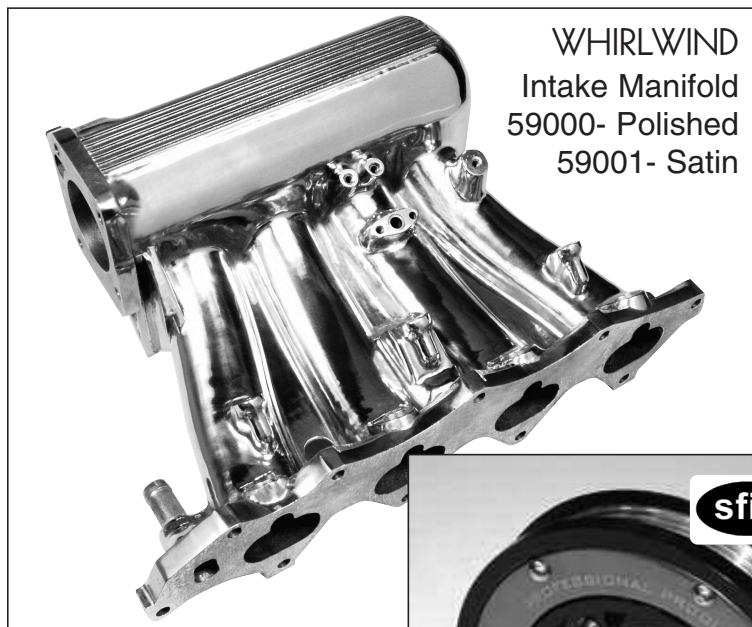
WHIRLWIND Intake Manifold 59000- Polished 59001- Satin